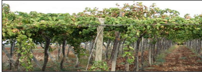
Vineyard at the Base of Mt Tabor, Jezreel Valley, Israel

Noah worked the soil and planted a vineyard. Could Noah have taken these vines with him on the ark? Could they have come originally from the Garden? We do not see the time element in Scripture for the vineyard, but it would have taken several years, five at least before there would be a harvest to make the first pressing of wine.